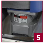
5 Powerful twin 1/2 HP gear motors