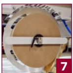
7 Easy tape roll replacement