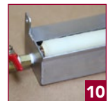
10 Adhesive activation with patented roller technology