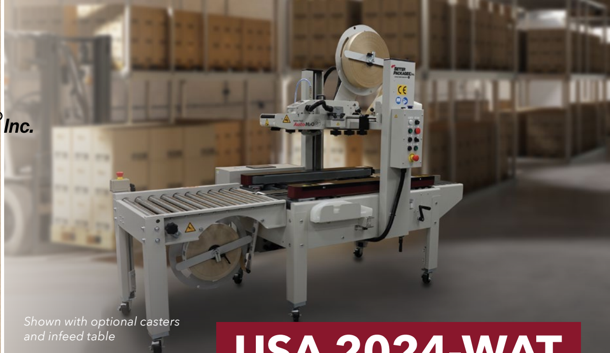
Shown with optional casters and infeed table