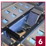
6 Double wipe-down of tape legs and center seam