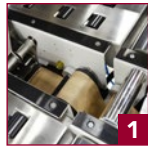
1 Easy tape threading