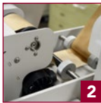
2 Powered tape unwind