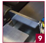
9 Pneumatic indexing gate assures proper spacing between cases