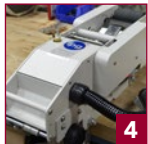
4 Easily removable tape head