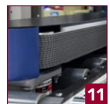
11 Premium side belt drive